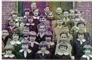
2nd - 4th Grade, 1928-29

Presently , St. Peter Catholic School offers high quality, faith-based, Christian education from preschool through eighth grade. The mission of the school is to provide an education which will nurture the spiritual, emotional, and academic growth of each student. Major renovations were completed in 2007 while enrollment has steadily grown. School families and faculty remain committed to the high moral and academic values of the past while preparing students for success in the future.